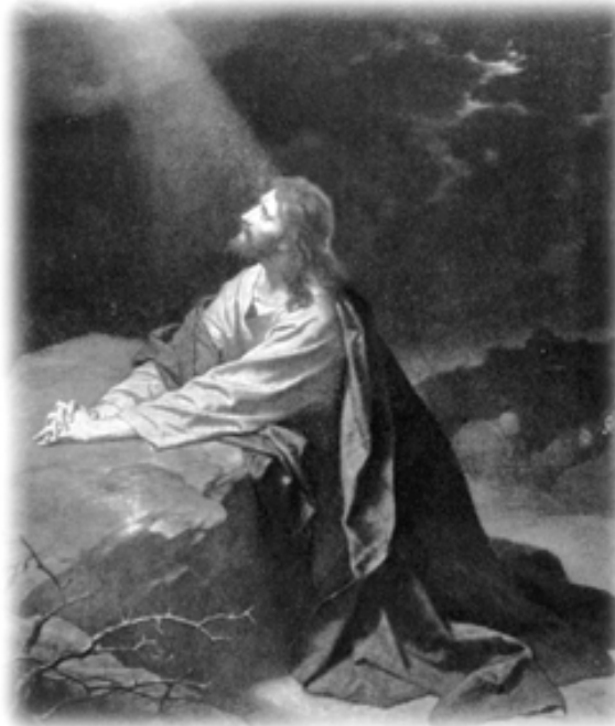
“Father, the hour is come; glorify thy Son, that the Son also may glorify thee...” John 17:1

The result of Jesus’ sacrifice will be “testified in due time,” when he will raise the dead and set up his righteous Kingdom among men, destroy all enemies (including death), and “when all things shall be subdued unto him, then shall the Son also himself be subject unto him that put all things under him, that God may be all in all.” (1 Corinthians 15:28) In Jesus’ own words, “And this is life eternal, that they might know thee the only true God, and Jesus Christ, whom thou hast sent. I have glorified thee on the earth: I have finished the work which thou gavest me to do.” John 17:3-4